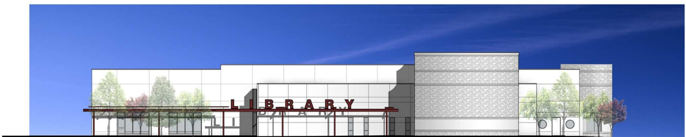
A - WEST ELEVATION