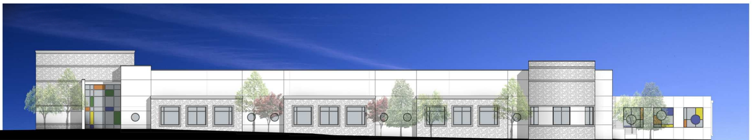
B - SOUTH ELEVATION